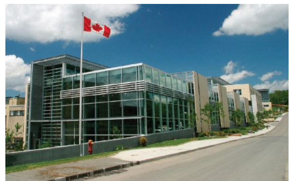
AMTC at the campus of the Université de Montréal