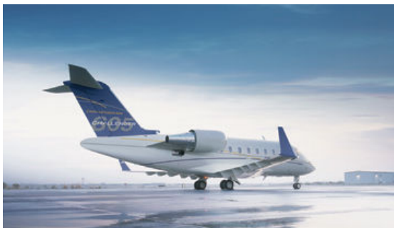
Bombardier Business Aircraft