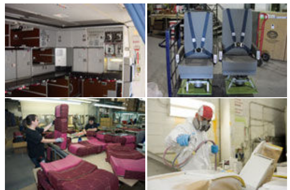
Manufacturing of Interior Parts

Avianor Inc. involved in the design, manufacturing, repair, overhaul and distribution of aeronautical equipment. The company specializes in the manufacturing of interior equipment such as galleys, catering equipment, inserts, crew seats, closets, dividers and a multitude of customized products. Avianor also distributes a complete line of aircraft maintenance products. ( www.avianor.com )