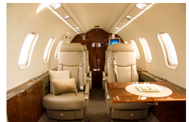
Business Aircraft Interior